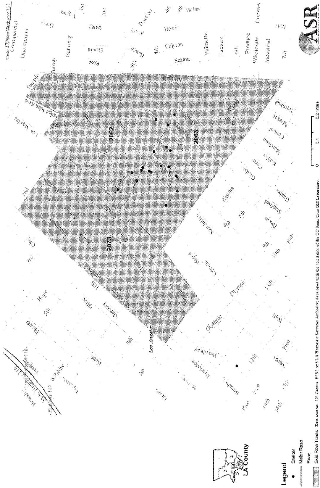
Figure 1: Map – Skid Row